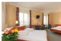
Hotel Bernina Geneva, Switzerland 3* / 85 rooms