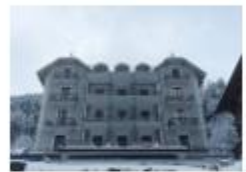
Hotel National Champéry, Switzerland 4* / 16 rooms