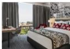
Ramada Encore Tbilisi Tbilisi, Georgia 4* / 152 rooms