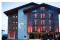
Chandolin Boutique Hotel , Switzerland 4* / 27 rooms