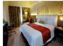
Marriott Moscow Imperial Plaza Moscow, Russia 5* / 272 rooms Future opening (2020)