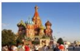
AC by Marriott Moscow Sadovaya, Moscow, Russia 4* / 225 rooms Future opening (2022)