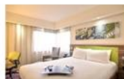
Hampton by Hilton Canakkale Gallipoli, Turkey 4* / 85 rooms