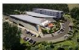
AC by Marriott, St Julien-en-Genevois, France 4* / 92 rooms Future opening (2022)