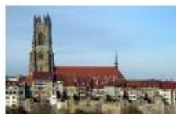
Courtyard by Marriott Fribourg, Switzerland 3* sup / 88 rooms Future opening (2022)