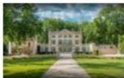
Château de Turreau Provence, France 5* / 16 rooms