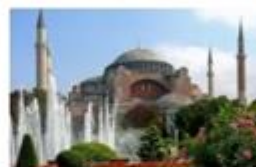
Hawthorn Suites Istanbul Ataturk Airport, Turkey 4* / 64 Suites