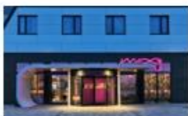
Moxy Sion, Switzerland 3* / 143 rooms Future opening (2021)