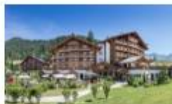
Chalet RoyAlp & Spa Villars, Switzerland 5* / 63 rooms & Suites