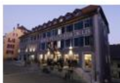
Hotel de la Fleur de Lis Le Locle, Switzerland 3* / 22 rooms