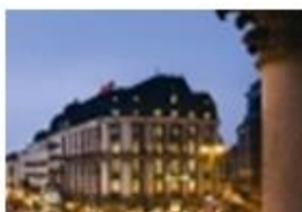
Marriott Mostar, Bosnia-Herzegovina 5* / 182 rooms Future opening (2022)