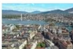
Hotel Residence CityZen , Geneva Switzerland 11 apartments