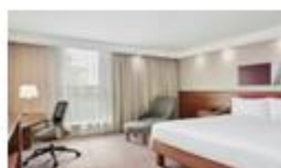
Hampton by Hilton, Istanbul Atakoy, Turkey 3* / 86 rooms