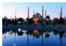
Tryp Istanbul Ataturk Airport, Turkey 4* / 140 rooms