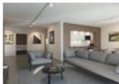
Résidence Hôtelière La Paudèze , Lausanne/Paudex Switzerland 6 Luxury Apartments