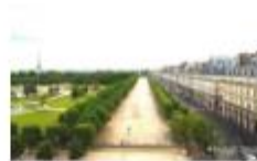
Hotel Saint-James Albany Paris, France 4* / 200 rooms