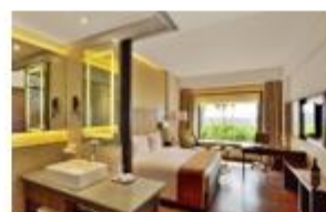
Courtyard by Marriott Bienne, Switzerland 4* / 104 rooms Future opening (2023)