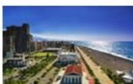
Courtyard by Marriott Batumi, Georgia 4* / 150 rooms Future opening (2021)