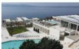
Novi Wyndham Grand, Croatia 5* / 496 rooms