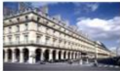
Westin Paris Vendôme Paris, France 4* / 440 rooms