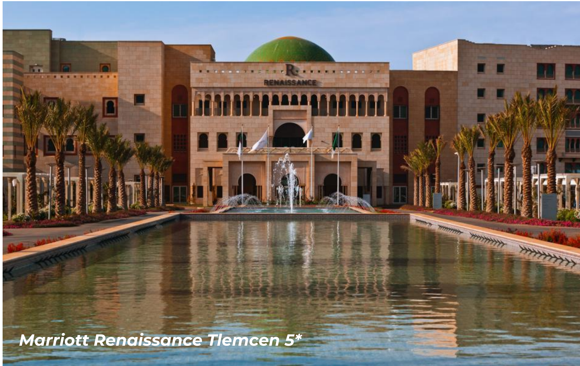
Marriott Renaissance Tlemcen 5*