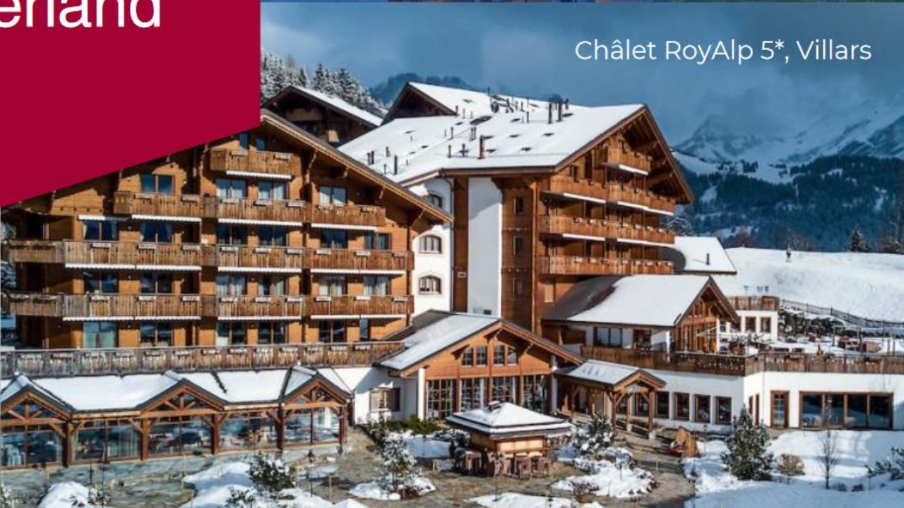
Châlet RoyAlp 5*, Villars