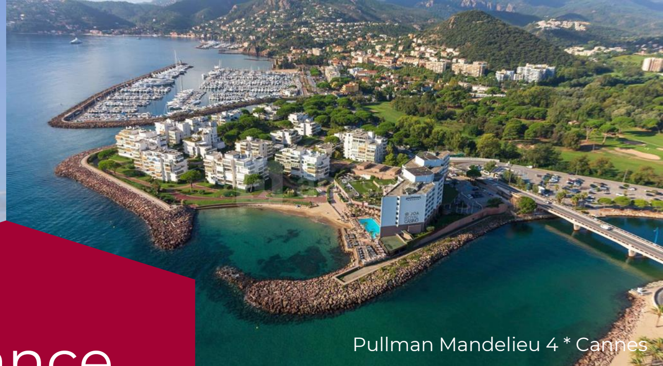
Pullman Mandelieu 4* Cannes