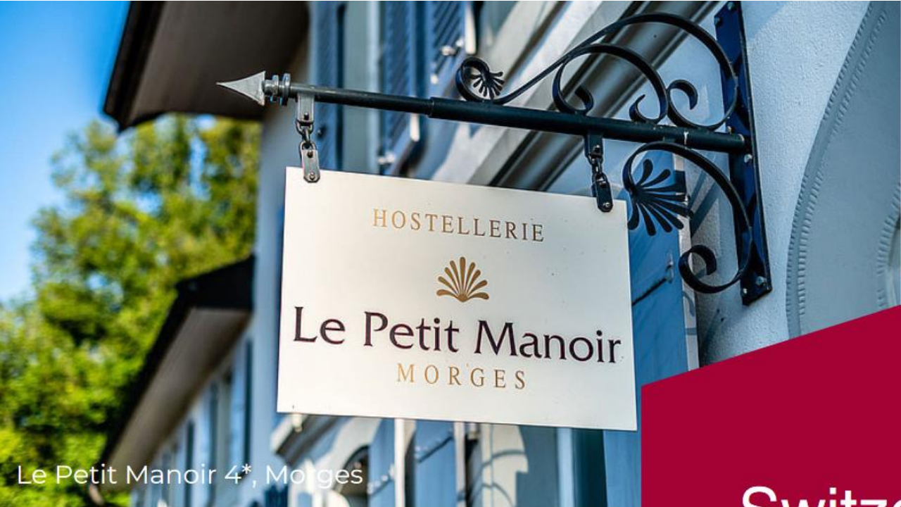
Le Petit Manoir 4*, Morges